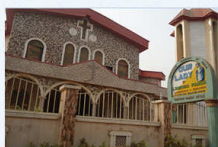
Our Lady of Lourdes, Cath. Church. Orlu, Imo State