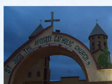
St Jude the Apostle Cath. Church. Onitsha