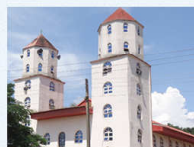
Immanuel Ang. Church, Akpugoeze. Anambra