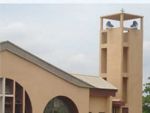
Sacred Heart Cath. Church. Uwani, Enugu