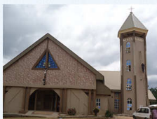
St mary Cath. Church. Nri, Anambra