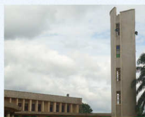
St Mary Cath. Church. Nnokwa. Anambra