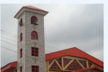
St Peters Cath. Church. Oho. Anambra.