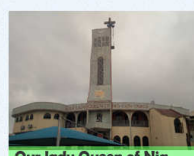
Our lady Queen of Nig. Cath. Church. Surulere Lagos