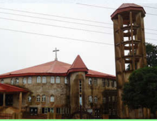
St Cyril Cath. Church, Egede