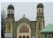
St Martins of tours. Cath Church, Ihiala, Imo.