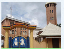
St Rita Cath. Church Ichida, Anambra