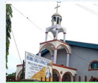
Regina Caeli Cath. Church, Calabar, Cross Rivers

" Over the past 10 years, we have installed our Automated church bell in over 200 parishes across Nigeria. "