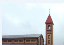
St Anthony Cath. Church Nanka, Anambra